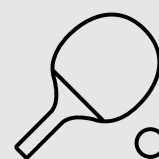
Table Tennis: 5